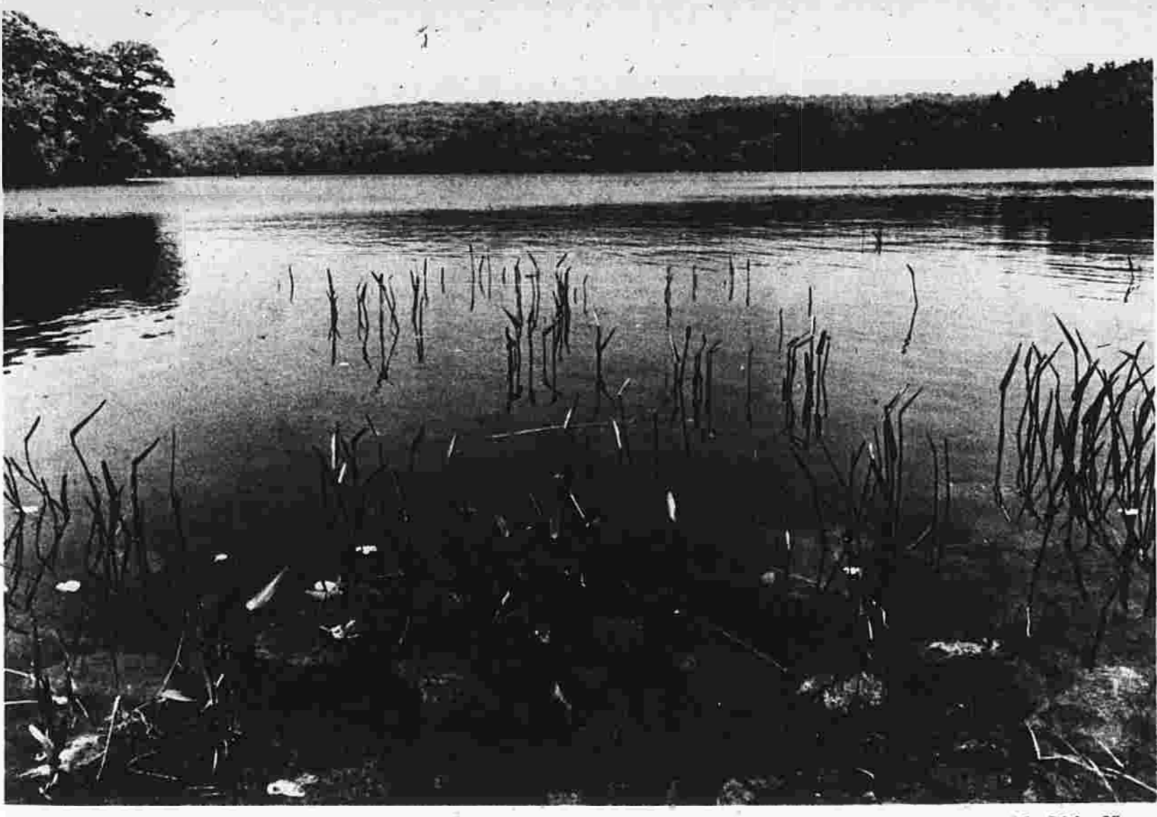
UNCAS LAKE, NEHANTIC STATE FOREST.

tion is faced with the problem of rethinking the 2x4. It will no longer automatically be one and so forth by three and so forth. It may be that, or it may be the new dimension, which we understand is one and one half inches by three and one half inches.