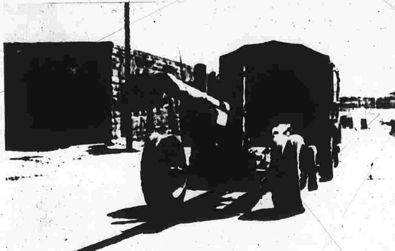
Soviet-made artillery piece rolls through Syrian village en route to Syrian border with Jordan. Tank brigades are supporting guerrillas.